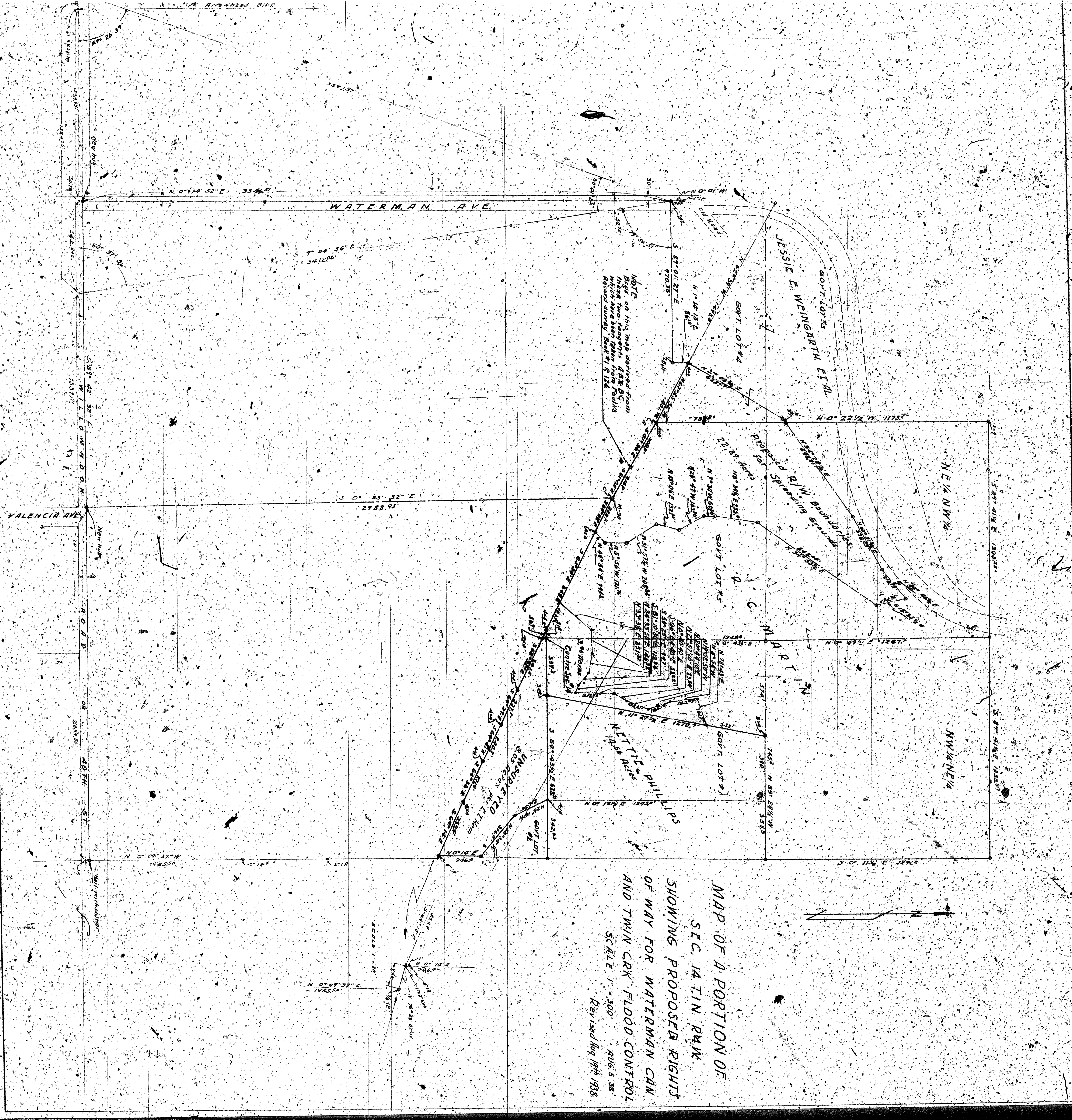
MAP OF A PORTION OF SEC. 14 T1N R4W, SHOWING PROPOSED RIGHTS OF WAY FOR WATERMAN CREEK AND TWIN CREEK FLOOD CONTROL SCALE 1" = 400' 246.5 38' Rev. Issued Aug 19th 1938.